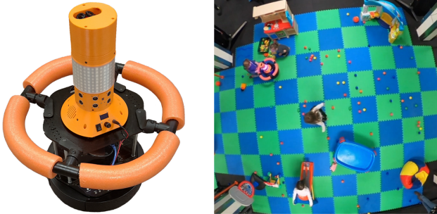
Fig. 2: Views of the assistive robot and play environment. Left: Custom assistive robot base and interactive module. Right: Overhead view of a playgroup session.

Light, electronic sound, and mechanical sound features were significantly more common for toys with the Gross Motor subtag in the 6-12 month age range than all other age ranges ( \chi^2(1, N = 189) = 7.24, p = .007 ).