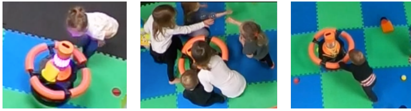
Fig. 1: Robot interactions with children. Left : Robot using lights. Center : Robot using bubbles. Right : Robot using motion.